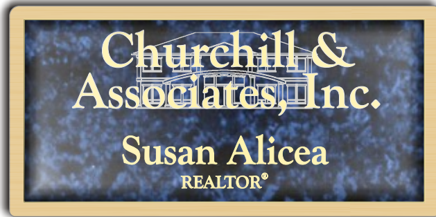
Style# chruch-102- Celestial Blue on Gold Frame + 3d Dome $14.00