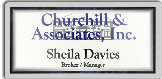
Style# chruch-107 - Pearl White on Silver Frame + 3d Dome $14.00