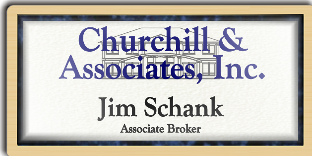
Style# chruch-108 - Pearl White on Gold Frame + 3d Dome $14.00