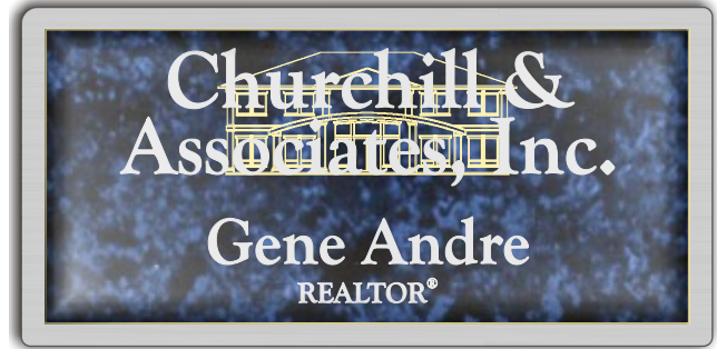
Style# chruch-101- Celestial Blue on Silver Frame + 3d Dome $14.00